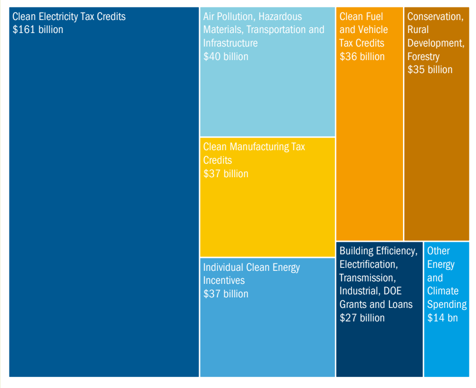
Figure 2: major areas and spending of IRA climate provisions