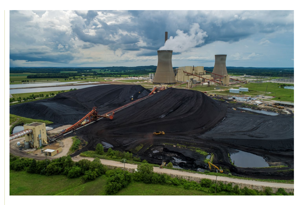
Governments have done little to curtail fossil fuels as access to cheap energy supports economic growth.

Through what has been another quarter dominated by macro and geopolitical factors, we did also see positive sustainable developments with a strong step forward in the US climate transition with the passing of the Inflation Reduction Act. We delve into this deeper below.